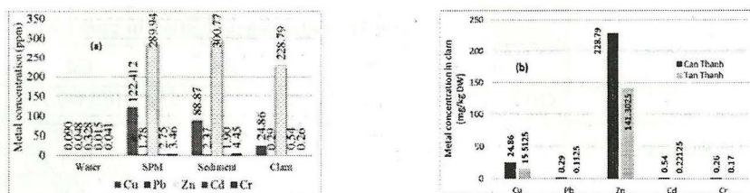
Figure 3. (a) Metal concentrations at Can Thanh; and (b) Metals in clams at Can Thanh and Tan Thanh.