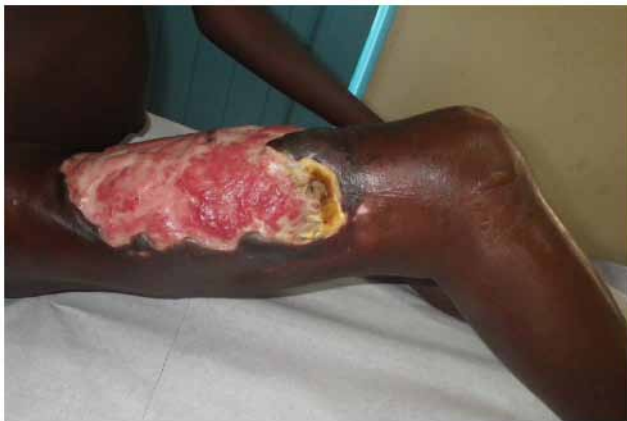
Fig. 3. A typical category III lesion of Buruli ulcer. Most Nigerian patients presented in medical center of Pobè in Benin with extensive ulcerative lesions. On the picture, the lesion of a Nigerian 10 years old child on the right thigh and with the typical characteristic of a late stage of the disease: large painless ulceration with presence of necrosis and undermined edges. doi:10.1371/journal.pntd.0003443.g003

river. These 3 draining systems discharge in separate lagoons that are interconnected by channels at the delta. Southeast Benin and Southwest Nigeria do not belong to the same drainage system, but these two Buruli ulcer endemic areas have a similar topography and climate, characterised by tropical rainforest, changeable topography with many small hills and fertile plains. Similar environments are encountered in other Buruli ulcer endemic areas of West Africa, for which the patients are found around different drainage systems but always with broad fertile richly inundated plains [17].