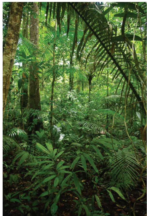
Figure 2 Example of an understory lowland tropical rain forest in the Parque Nacional do Amazonia (near Itaituba, Pará state, Brazil) dominated by palms. Foreground Bactris acanthocarpa var. excapa , upper right corner Attalea sp., middle left Euterpe precatoria , background: Astrocaryum gynacanthum .