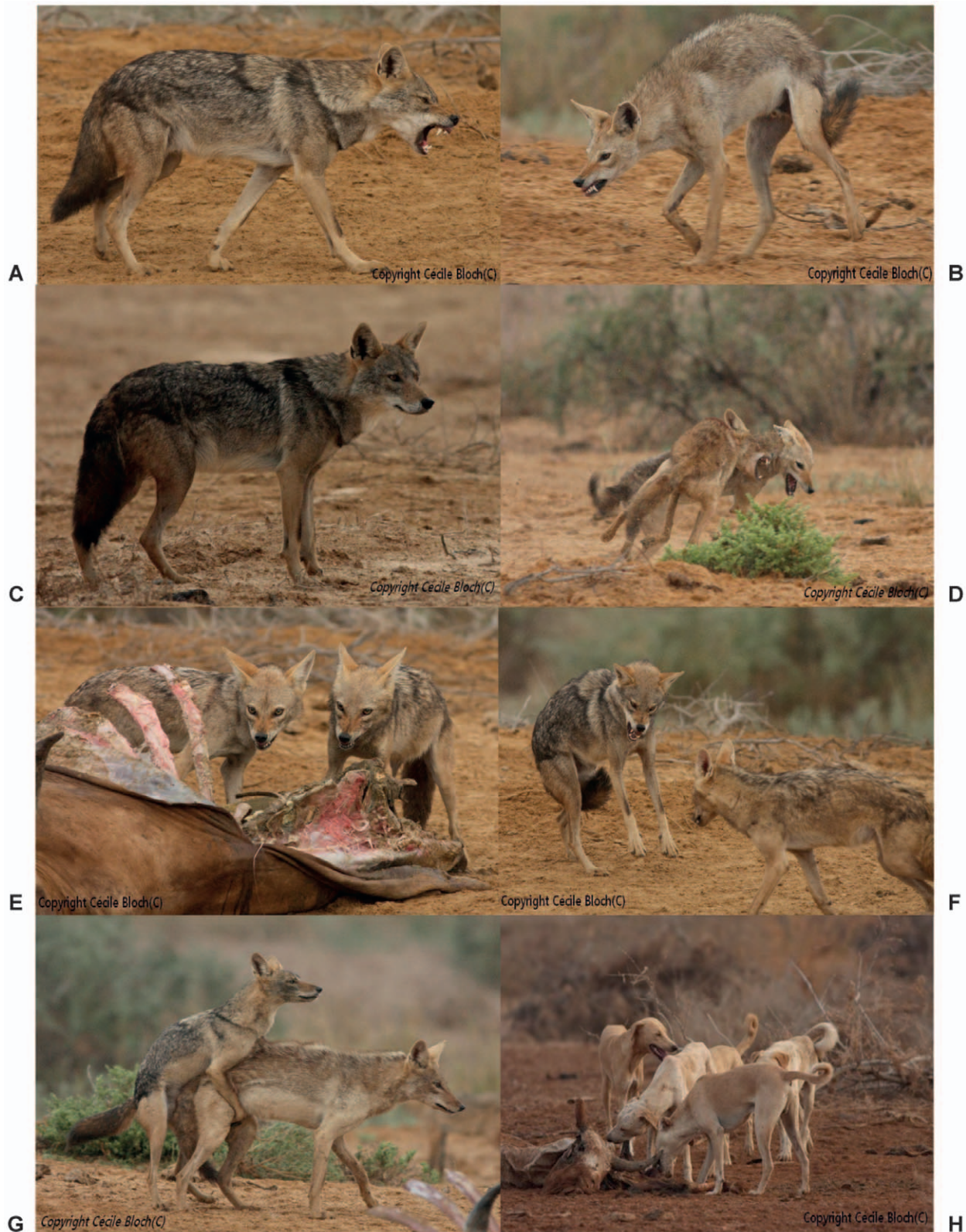
Figure 5. Phenotypic and behavioral traits between Canis species near Kheune, Senegal. A- Aggressive posture of the African wolf towards golden jackals; B- Aggressive posture of a golden jackal towards congeners; C- Typical 'wolf-like' phenotype, sampled in this study (T1361); D- Typical 'jackal-like' phenotypes, sampled in this study (T1360); E- Food guarding of golden jackals on a dead carcass of cow; F- African wolf (left) fighting with golden jackal (right) to access the dead carcass; G- Simulated mating between two male golden jackals; H- Phenotype of the feral dogs living in sympatry with the African wolf and the golden jackal. doi:10.1371/journal.pone.0042740.g005