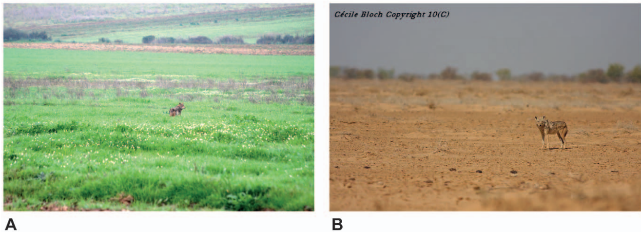
Figure 4. Habitats of the African wolf. A- Agricultural landscape with wildland ( Asphodelus microcarpus ), coastal region between Skikda and El-Kala, Algeria; B- Sandy Sahelian savannah with scarce shrub cover ( Tamarix senegalensis ), near Kheune, Senegal. doi:10.1371/journal.pone.0042740.g004

a distinct, relatively ancient gray wolf lineage encompassing a range 6,000 km wide, stretching from Senegal to Egypt. Increasing the geographic and genetic coverage of the present investigation will be necessary to further characterize the delineation among African wolf and jackal species, the dynamics of gene flow within the African wolf, and the impact of potential hybridization with the golden jackal on the distribution and adaptive nature of wolf- and jackal-like phenotypes. Given that ‘jackal-like’ canids in Africa are regularly killed to protect livestock, it appears urgent to engage into a conservation strategy for the benefit of the African wolf.