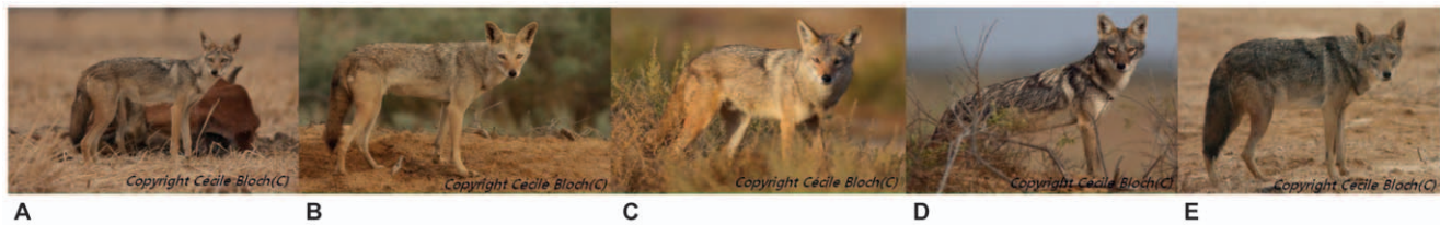
Figure 6. Phenotypic variation in the golden jackal and the African wolf near Kheune, Senegal. A- Typical 'jackal-like' phenotype; B- 'Jackal-like' phenotype tending towards C; C- 'Intermediate' phenotype between golden jackal and African wolf; D- 'wolf-like' phenotype tending towards C; E- Typical 'wolf-like' phenotype.. doi:10.1371/journal.pone.0042740.g006

AIC and BIC criteria [43]. The sample set was restricted to our generated sequences and a sub-sample of the wolf-like clade representatives for which this coherent segment ( CYTb + CR) was covered in Genbank. We did not use outgroups since BEAST samples the root position (along with the rest of the tree nodes). We assumed a constant size coalescent model [41]. Operators were tuned manually after screening of effective sample size values from preliminary runs, to maximize their efficiency and obtain convergence in poorly estimated parameters [44]. Chain lengths were 100,000,000, sampled every 10,000 generations. Analyses were run twice independently. Log files were concatenated under LogCombiner 1.6.2 [44] with a final burn-in of 1,000. Convergence and stability of estimated parameters were checked using Tracer 1.5 [45].