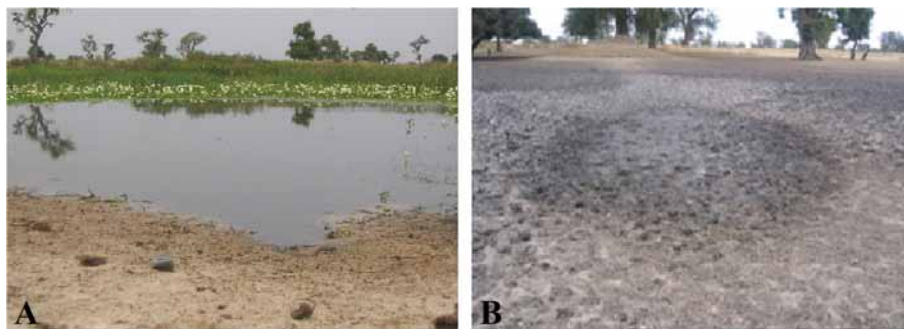
Fig. 2 Pictures showing the water bodies of the Niakhar area: a filled pond from July to November (a) and a dry pond from December to June (b)

total number of snails tested represent the infestation rate.