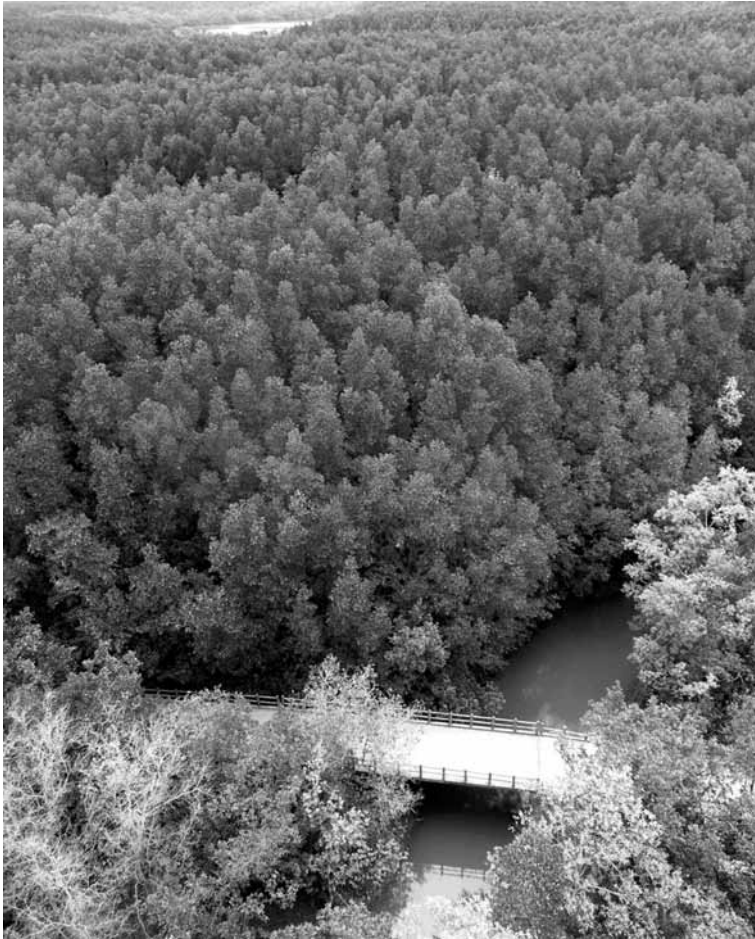
Figure 2 : Photo of the Vietnam mangrove forests: the contrasted mangrove-scape testifies the contrasted management regime CanGio mangrove, South Vietnam

and to protect the mangrove forest. To-day, there are 160 protective families, every family is responsible of on average 80 ha (the smallest protected forest is 25 ha and the biggest, 300 ha). They could conserve their charge as long as they fulfill their duty.