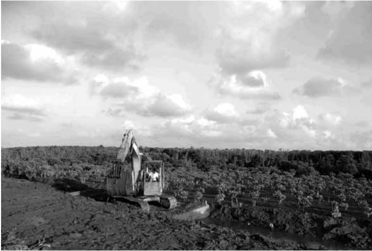
Figure 3 : Xuan Thuy mangrove, North Vietnam In CanGio as in Xuan Thuy mangroves (Fig. 3), in spite of the differences of regime (strict control versus lack of management), we raise a game of powers between the representatives of the central and provincial government, the protective families or endowed with concessions, the foreign and migrant users and, at the same time, a strong social dynamics with the enrichment of certain actors (new traders in CanGio, stemming from protective families; breeders of clams in Xuan Thuy). In the CaMau mangroves, Ha et al (2011) point out a similar imbalance in access to finance, markets, and differences in authority between the two actors, farmers and State Forest Companies. This expresses the unequal distribution between first inhabitants and immigrants, as well as among privileged government officers and farmers.

acuteness the question of the legal status of mangrove: are they pioneer fronts, in the limits ceaselessly moved forward in the maritime infinity, as the mangrove of Madagascar or the North Vietnam, converted into shrimp ponds? Are they amphibian garden spaces in the hands of peasant-fishermen's communities as the mangrove terroir of Northern Rivers? Or are they still wild sanctuaries, refuges habitats for numerous botanical and animal species in danger as the mangrove of Guiana? Besides, to whom belong mangroves? Are they local, national or world heritage? Who are the beneficiaries? To whom return the benefits of the conservation of their services?