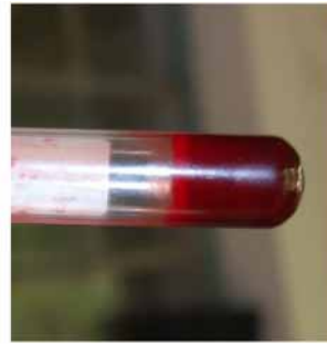
Normal: a solid clot is retained upon inversion of the tube at 20 or 30 minutes (Grade 0, no coagulopathy).