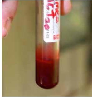
Collection: a blood sample for WBCT testing immediately after collection.

If the clot breaks down quickly upon inversion of the tube or if there is no clot, the test indicates a coagulopathy. A friable clot is pictured below.