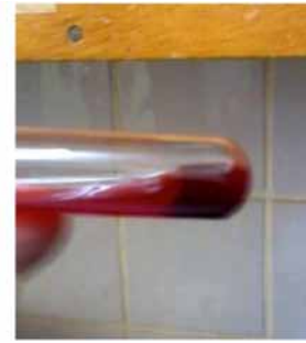
Abnormal: clot degrades rapidly (Grade 1, friable clot) or there is no clot (Grade 2).