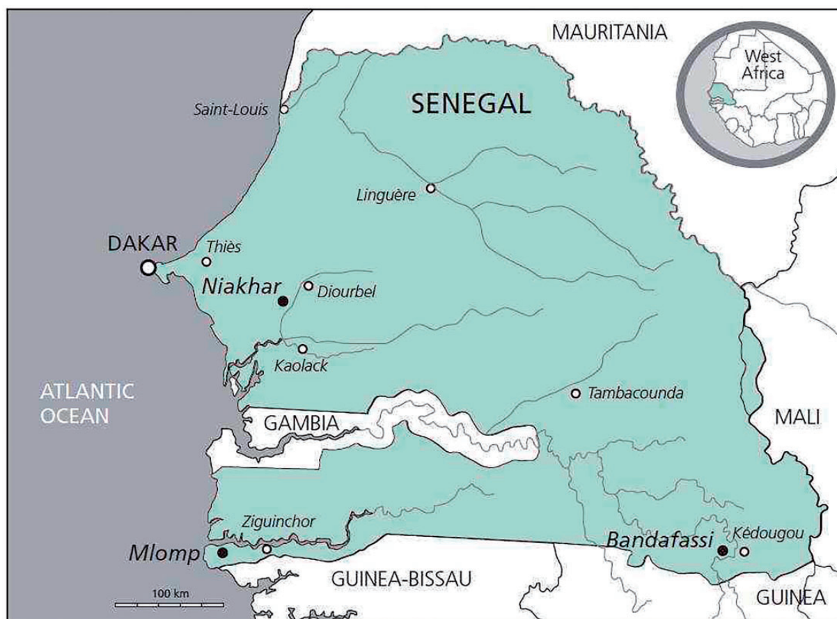
Figure 1. Location of Mlomp and the two other HDSS sites in Senegal.

The site is in a Guinea savannah and mangrove ecological zone. The area has a rainy season from June to October and a dry season from November to May, and had average annual rainfall of 1250 mm over the period 1985–2010.