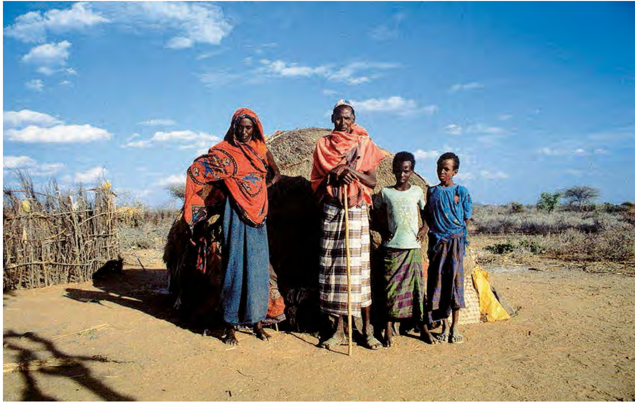
A family displaced by drought in Kenya.

With land flooded by the rise in sea level, natural catastrophes, wars and conflict for access to resources etc., climate change may cause the departure of millions of people from their regions, creating as many 'climate refugees'. The term certainly makes sense when the effects of climate change are sudden and extreme, wiping out all local capacity to adjust to the suddenness and scale of the event. As researchers are cautious with regard to the links between certain extreme phenomena and global warming, the term 'climate refugees' should be used with caution and the use of 'environment refugees' preferred. Then if the areas affected occasionally or definitively by changes may be very varied, it is rare for changes to result in massive, rapid migrations across the frontiers of states. From this point of view, describing these migrants as 'refugees' is inappropriate with regard to international law.