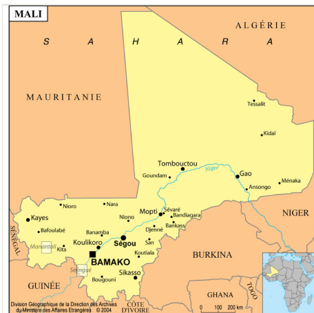
Figure 8. doi

In 2002 and 2003, a comparative study was conducted by the RAP research unit of IRD in Mali, to better understand the impact of fishing effort on fish assemblages. This study was funded by the Priority Solidarity Fund ( Fonds de Solidarité Prioritaire - FSP), part of the French Ministry of Foreign Affairs. The Manantali and Sélingué man-made reservoirs (Fig. 8) were selected because of their similar size and edaphic and environmental properties, but subject to different degrees of fishing pressure: low at Manantali vs. high at Sélingué (Kantoussan 2007). Manantali is located between 12.9° and 13.3° North and 10.2° and 10.4° West and Sélingué is located between 11.2° and 11.6° North and 8° and 8.4° West. Three methods of assessment were combined for this study: fish gillnet sampling, surveys of artisanal fisheries and hydroacoustics (Coll et al. 2007).