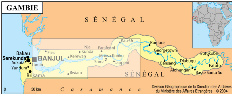
Figure 7. doi

A joint IRD/Gambian Fisheries Department research programme was conducted from 2001 to 2003, for the “Evaluation of the fish resources and estuarine resources stewardship of the Gambia River”. It was funded by the French Department for Cultural Action and Cooperation (SCAC). The study area comprised the lower, middle and upper estuary, from Banjul at the mouth to Deer Island 220 km upstream (Fig. 7). The Gambia estuary is located between 13.2° and 13.7° North and 15° and 16.6° West. In this region, the wet season extends from June to October, with peak rainfall in August. The cool dry season lasts from November to March and the warm dry season from April to June.