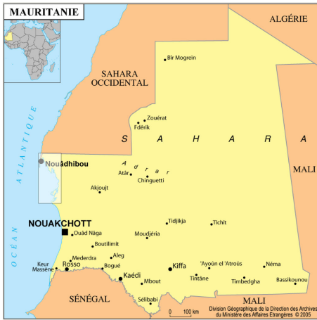
Figure 9. doi

Map of Mauritania showing the location of the Banc d'Arguin National Park (box).