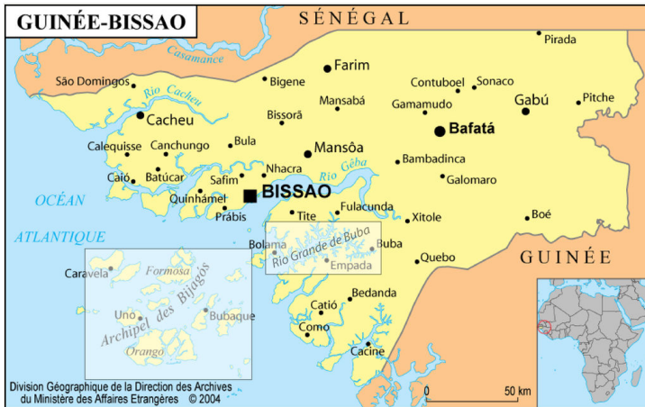
Figure 6. doi

in the west central region of Guinea-Bissau, between 11.4° and 11.7° North and 15° and 15.5° West. It flows into the Atlantic Ocean in front of the Bijagos Archipelago (Fig. 6).