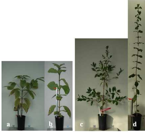
Figure 1. Habit of Coffea canephora (CAN): (a) control plant, (b) plant without branch; and Coffea racemosa (RAC): (c) control plant; (d) plant without branch. Photographies December 2008.

with the leaf and axillary production). Plant topology was recorded following MTG formalism [2] using Xplo software ( http://amapstudio.cirad.fr/ ). For each phytomer, the length of the underlying internode, the presence of branches and leaves were recorded. Each leaf was cut, weighed and scanned. Leaf areas were estimated by analyzing the images with Taoster (plug-in implemented in ImageJ freeware [3]). The plant axes were cut internode by internode. The fresh mass of each phytomer (stem and leaves have been separated) was recorded.