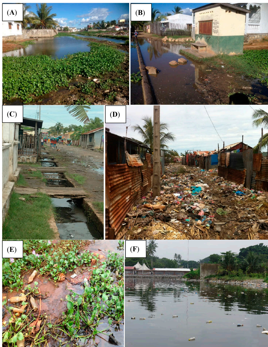
Figure 1. Plastics and garbage in an open sewer network; (A–D) Mahajanga, Madagascar, 2014, (A,B) open sewer network, (C) standpipe in a flooded area, (D) garbage pen in an area liable to flooding; (E,F) Ébrié Lagoon in Abidjan, floating plastics.