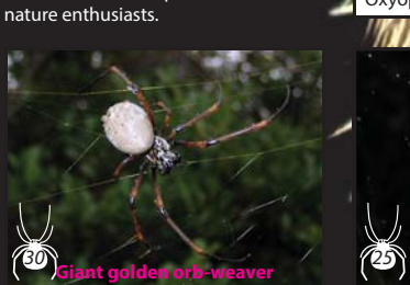
Araneidae - Trichonephila plumipes

From far being exhaustive, this poster presents a selection of 30 portraits, representative of the extreme diversity of forms and lifestyles, including some emblematic species such as a tarantula, a black widow or a spiny orb weaver, and others that are much less known but are of equal interest to