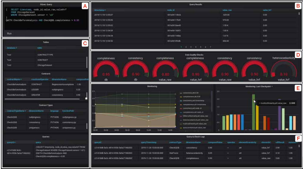
Figure 6: Screenshot of MeSQual’s User Interface with Dynamic Dashboards

• Continuous data-quality checking and monitoring. MeSQual results can help the user in defining or comparing various methods for checking and profiling the quality of data over time, selecting the most appropriate ones, or refining the data quality checking process, and select the most appropriate contracts to monitor continuously;