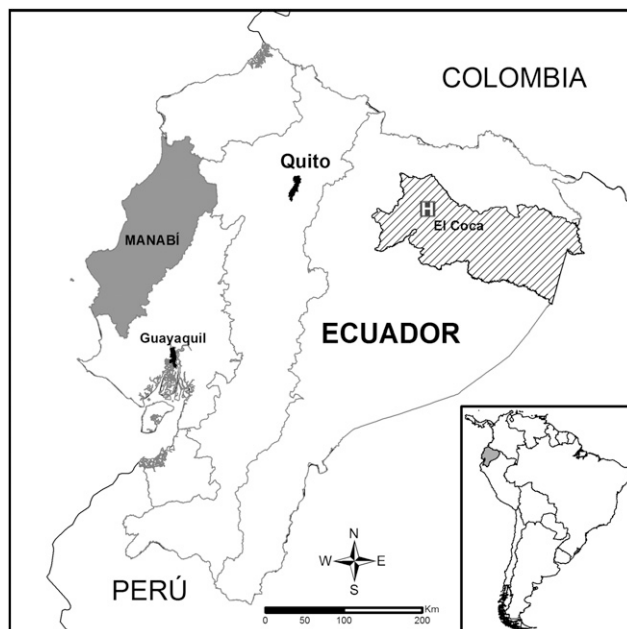
FIGURE 1. Map of Ecuador showing relevant features. The H symbol marks the location of Francisco de Orellana Hospital, within Orellana Province. Also shown are the cities of Quito (Ecuador's capital) in the highlands, and Guayaquil, in the coast, where the national reference laboratory for Chagas disease is located. Manabí Province, a well-known endemic region within Ecuador, is also shown.

Study design. From June 22 to August 15, 2016, a cross-sectional study was conducted among pregnant women at the Francisco de Orellana Hospital (El Coca) located in the Amazon region in Ecuador (Figure 1). A serological screening for infection with T. cruzi and a questionnaire to describe the study population and its knowledge about vectors and Chagas disease as well as to examine risk factor associations were implemented. The study was approved by the Committee of Ethics in Research with Human Subjects from Pontificia Universidad Católica del Ecuador (approval number CEISH-