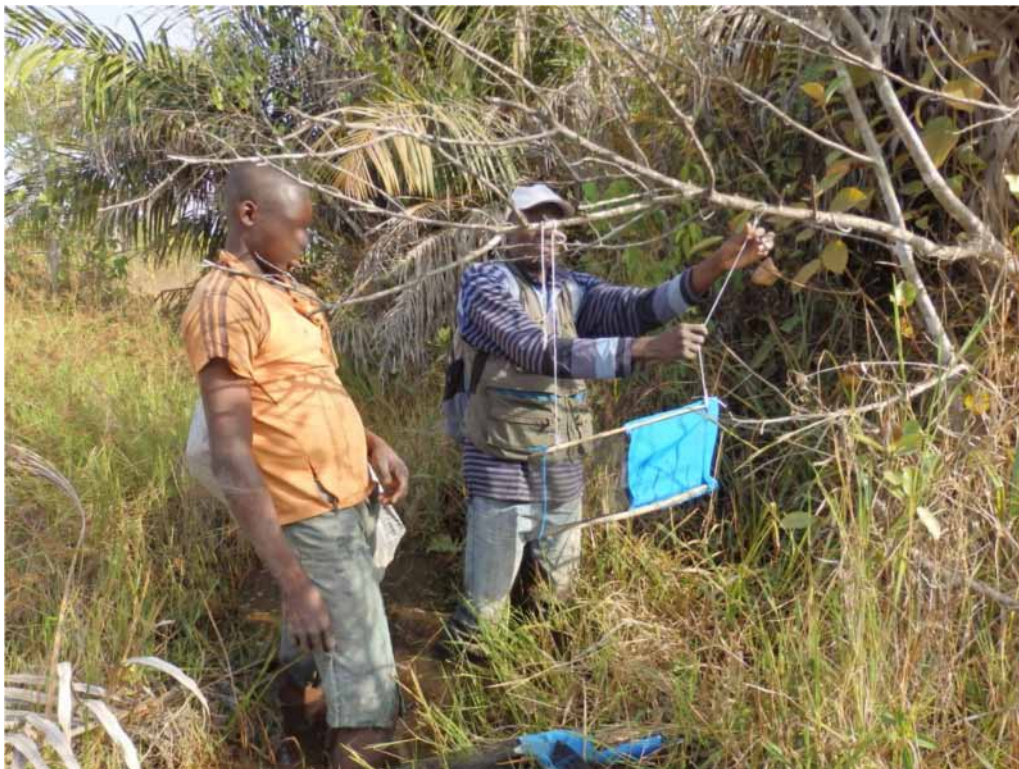
Fig. 4 Target deployment

At the end of 2014, further sensitisation work was undertaken. The CSSEs were revitalised: contacted and made aware of the upcoming second target deployment in January 2015. The radio spot was again broadcast, but only twice daily, for between three and seven days. As the CSSEs were village-based, it was felt that further outreach was required to inform the transhumant pastoralist populations who migrate into the area during the dry season with their stock. Furthermore, it became evident that the hanging targets were sometimes displaced by cattle, which caught them in their horns when going to the marsh to drink. Thus, in March 2015, it was decided to inform pastoralists