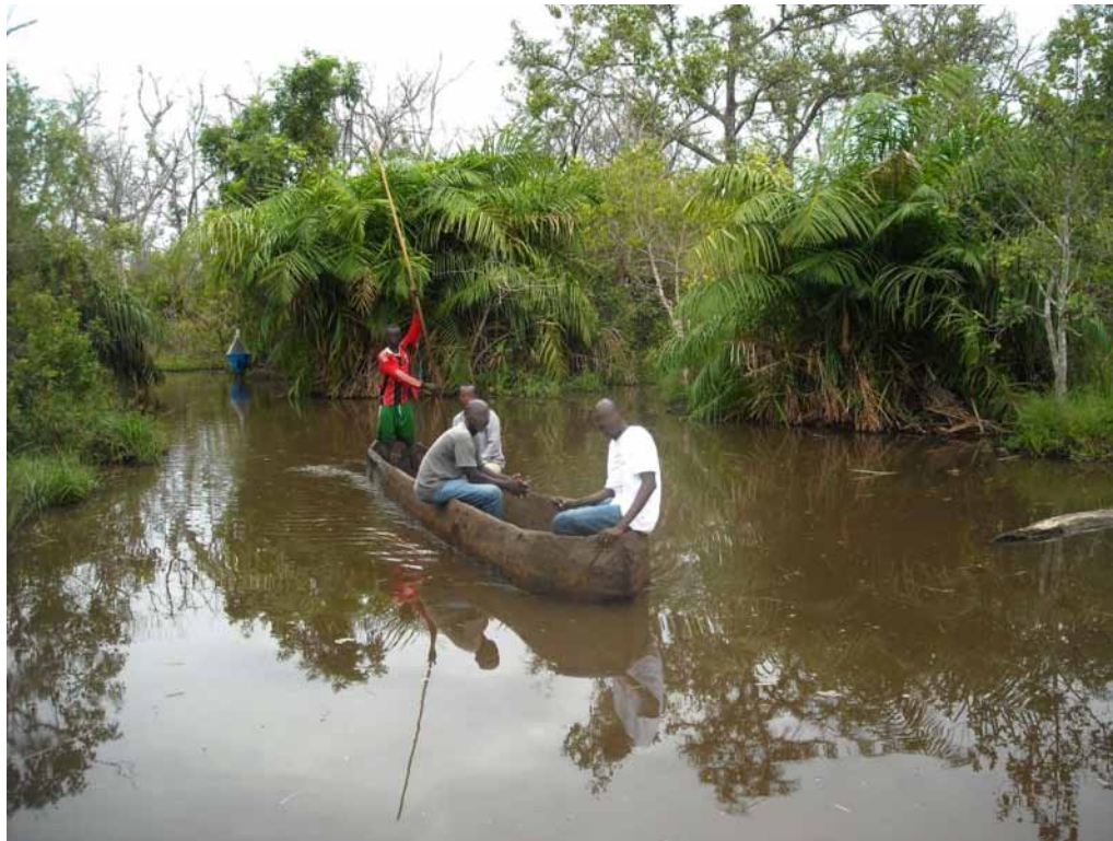
Fig. 5 Accessing target deployment and trap monitoring sites by canoe (note the biconical trap just behind the canoe)

about the tiny target operation and distribute leaflets to them. The cost of these two operations came to USD 6551 working out at USD 7.8 per km 2 (Table 4).