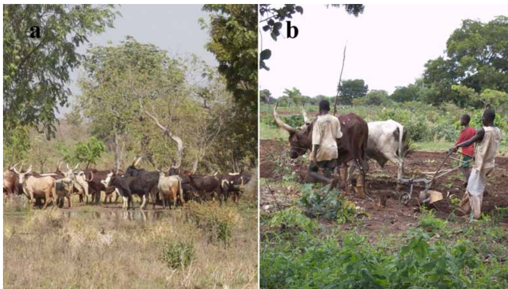
Fig. 2 Cattle in the Mandoul HAT focus. a Mbororo transhumant cattle grazing in marshland. b Sedentary cattle used for animal traction

Secondly, the objective is to work out the costs of a control, rather than a research operation. The tiny target projects undertaken to control HAT in Chad, Côte d'Ivoire, Democratic Republic of Congo, Guinea and Uganda [21,