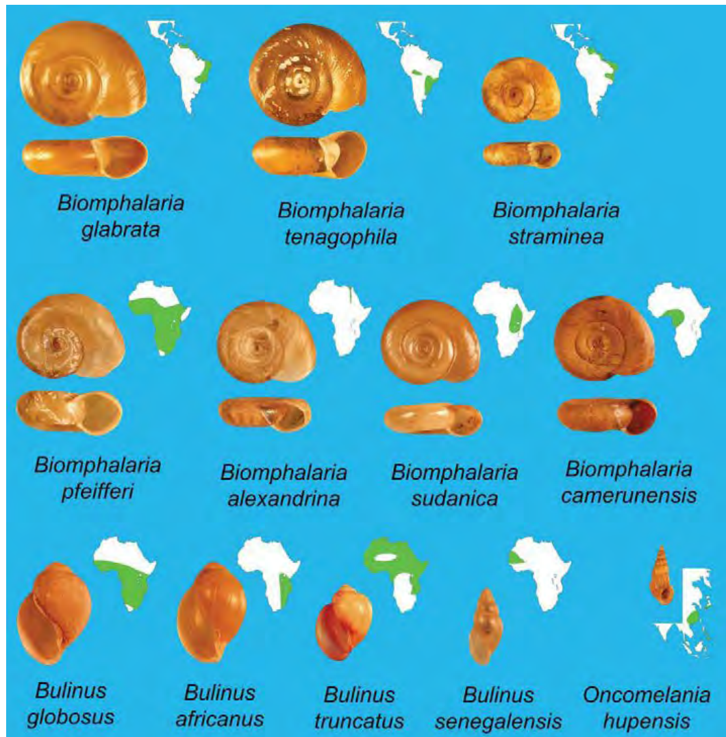
Figure 1. Intermediate snail host species of major global importance (adapted by Dr H Madsen from World Health Organization (1989) slide set: The intermediate snail hosts of African schistosomiasis. Taxonomy, ecology and control)

Snail control also increases awareness of the disease within the community and offers opportunities to reinforce health education interventions alongside preventive chemotherapy.