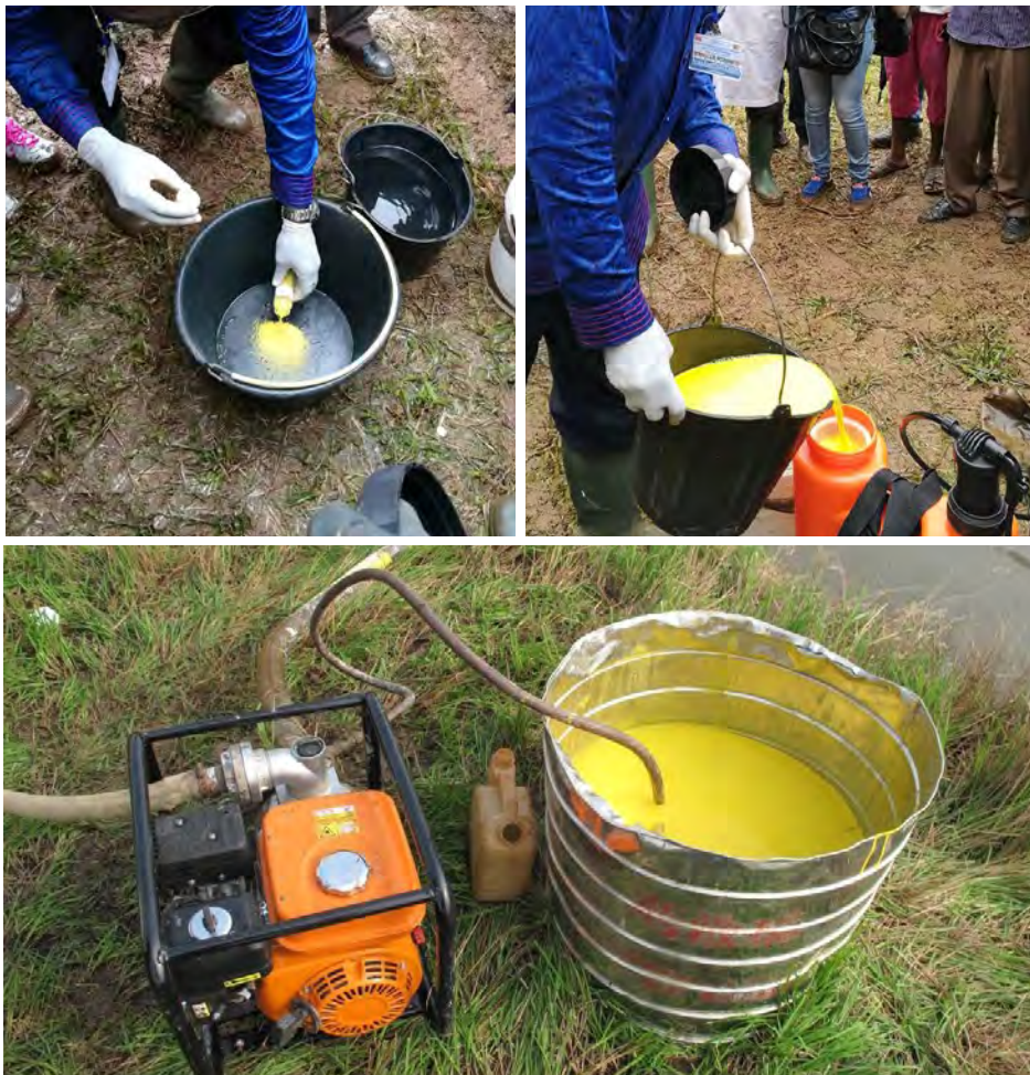
Figure 3. Preparation of molluscicide

Niclosamide toxicity has been assessed by WHO 2 . The 1983 monograph by Andrews et al. (1983) provides extensive information on the chemistry, biology and toxicology of niclosamide as well as its effects on non-targeted plant and animal species. Niclosamide's environmental impacts have been more recently reviewed in a study using niclosamide for