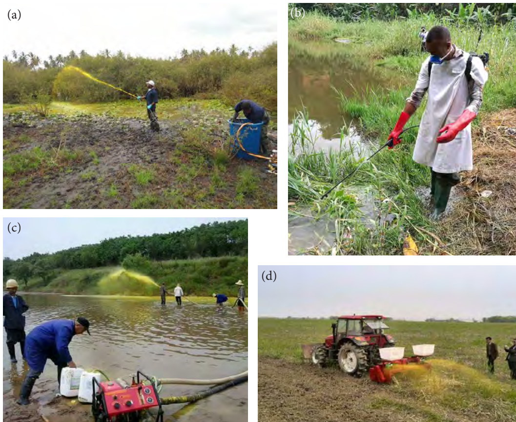
Figure 4. Snail teams applying niclosamide in Zanzibar, United Republic of Tanzania against Bulinus spp. in a Schistosoma haematobium control programme (a), in Cameroon (b) and in Wuhan, China (c, d) against Oncomelania spp. in a Schistosoma japonicum control programme