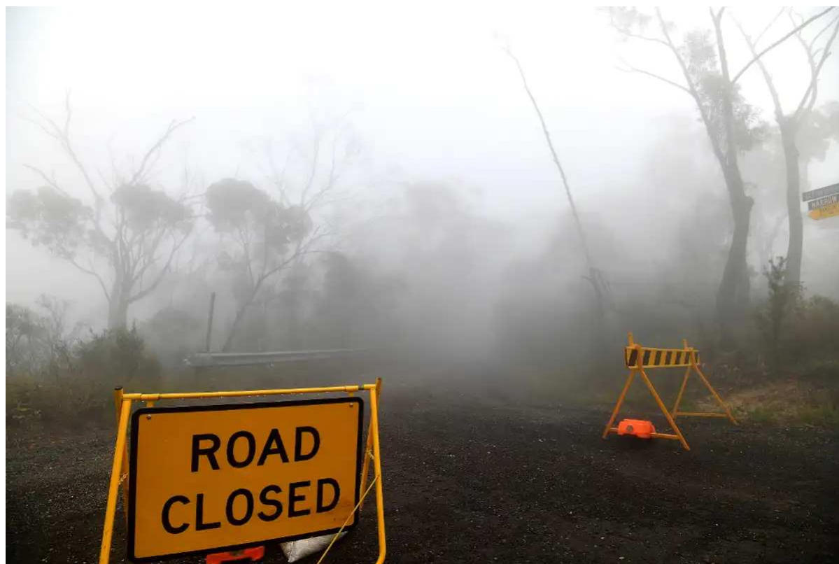
In January 2020, in the vicinity of Sydney, a thick fog due to massive fires devastated large parts of the Australian territory.

France, but is essential to gaining a better understanding of the complexity of the modern world and finding more comprehensive solutions to the economic, social and environmental challenges facing our societies.