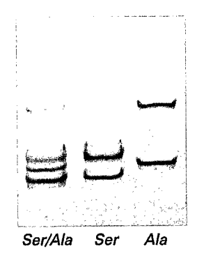
Fig. 2 Silver-stained SSCP gel showing the three phenotypes observed at the Rdl locus in Hypothenemus hampei . Ser, Ala, and Ser/Ala : SSCP phenotypes for PCR products from R individuals, S individuals and heterozygous R \times S females, respectively.