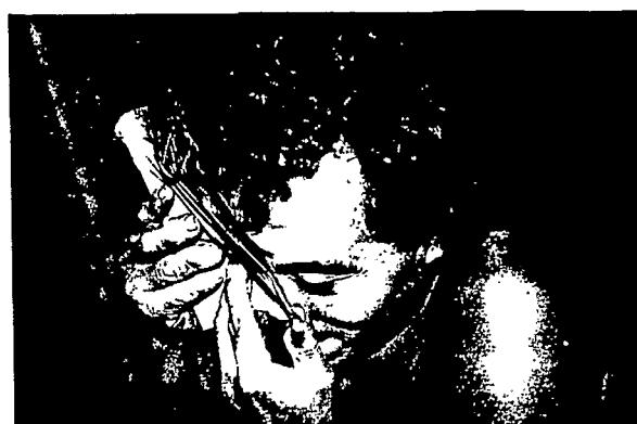
Fig. 3. Use of the young leaves of a leguminous tree to treat eye infection. The leaves are heated in the flames of the fire and held close to the open eye as a poultice.

which had stayed on the upper Lobo d'Almada in the 1970s and who rejoined the people of Watorikit h eri in 1984. Two of the eldest surviving shamans (Noé and Valdo) died at the end of the 1980s, leaving only the current leader Lourival surviving. This had resulted in a very unbalanced age distribution within the group, of whom only 35% were adults over 20, nine were above the age of 40 and one over 50.