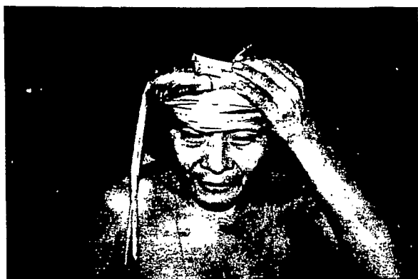
Fig. 2. Direct application of the aromatic crushed stem of Renalmia (Zingiberaceae) to treat headache.