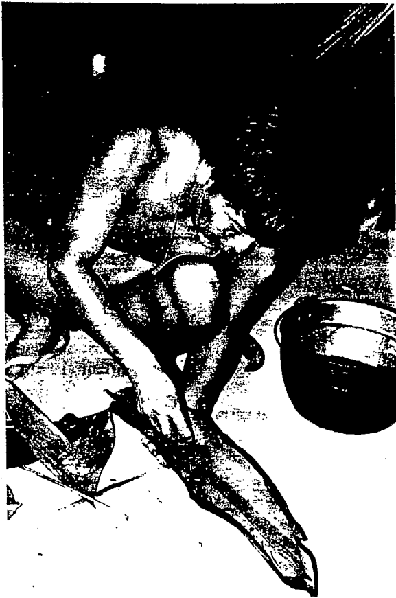
Fig. 4. Preparation of a medicinal bark. The bark scrapings are being wrapped in a marantaceous leaf and will be cooked in the fire before the juice can be extracted and drunk.

jointly. In general, however, the use of mixtures of plant species appears to be relatively rare in Yanomami medical practice; the great majority of the plants being used on their own. Most of the medicines are prepared from the leaves or the bark of the plants concerned (Fig. 5).