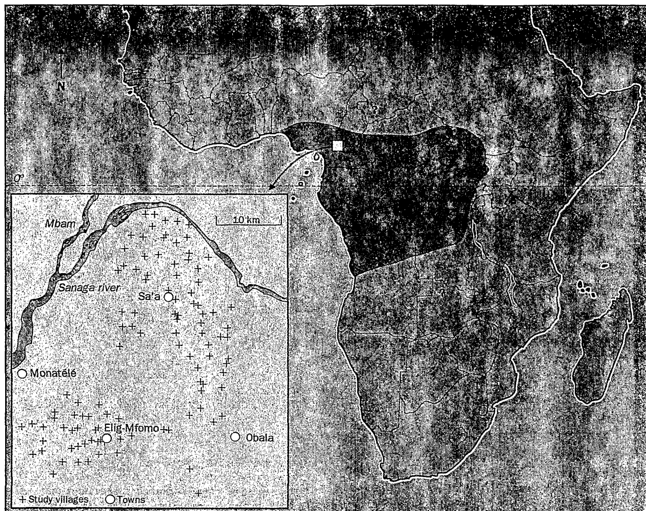
Figure 1: Distribution of Loa loa and situation of study area and study villages

+ = study towns and villages. Dark green area is that endemic for Onchocerca volvulus and Loa loa . ? = endemicity not known.