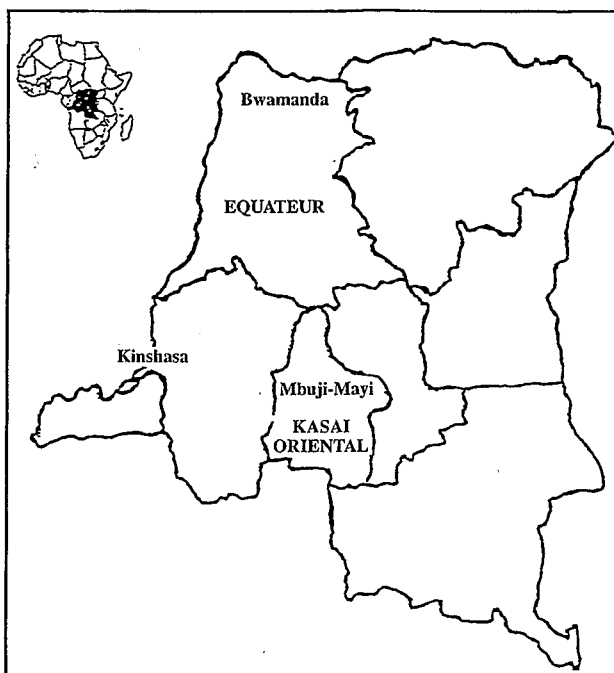
Fig. 1. Map of the Democratic Republic of the Congo.

Considering the large size of the country, the study reported here was carried out in the regions indicated in Fig. 1. Kinshasa is the capital city, economic centre and focal point that links the country to other continents. Mbuji-Mayi, in the Kasai oriental province, is in the southeastern part of the country, and is a second world producer of industrial diamond. In 1993, the city experienced a rapid demographic change as a consequence of the displacement of hundreds of thousands of people from the Shaba province who arrived as refugees. Bwamanda is in the Equateur province, and is a rural town situated in the northwestern part of the country, neighbouring the Central African Republic. It is well known for its coffee culture, which constitutes the main economical activity and source of income for the local population. Mbuji-Mayi and Bwamanda are fairly rural compared with Kinshasa.