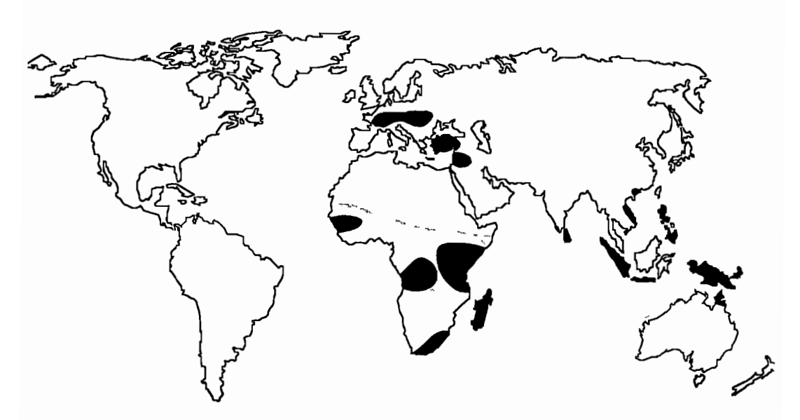
Fig 5 Distribution of the family Prosopistomatidae