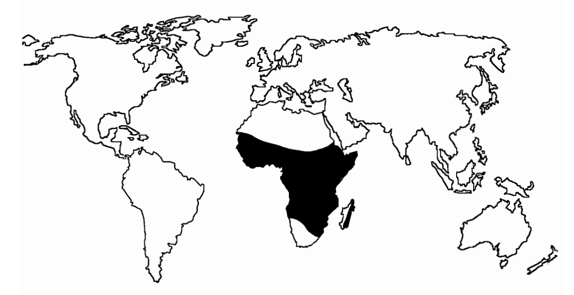
Fig 3 Distribution of the Ethiopian ephemererid genus Eatonica Navas