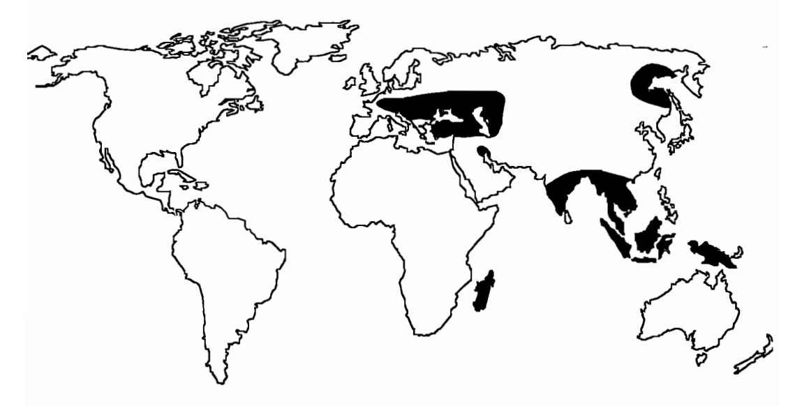
Fig 4 Distribution of the family Palingeniidae